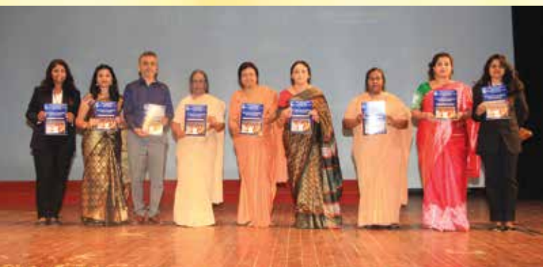
Commerce and Management: 'Samruddhi'