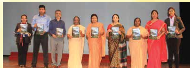
Tourism and Travel Management: 'Tornare' (Journal)