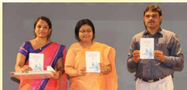
The Department of Kannada brought out Kannada Sahitya Samvada, for I and II semesters Arts, Science and Commerce students.