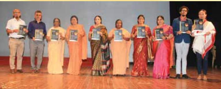
Internal Quality Assurance Cell: 'IQAC Newsletter'

Several departments bring out their annual Newsletters to record their achievements and endeavours during the year: