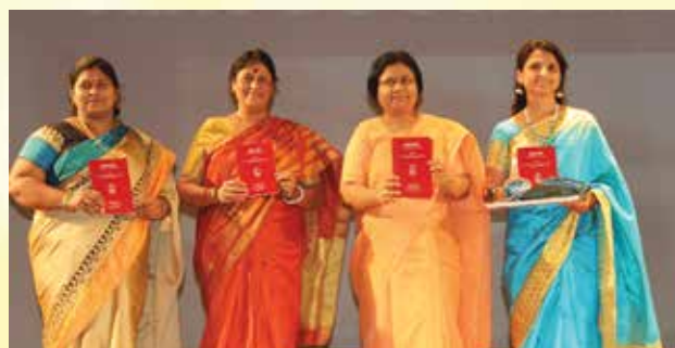
The Department of Hindi brought out Kavya Tarang for I semester BA and BSc.

own textbooks in General English, Additional English and Optional English. This year the Dept. brought out textbooks for semesters I and II for the same.