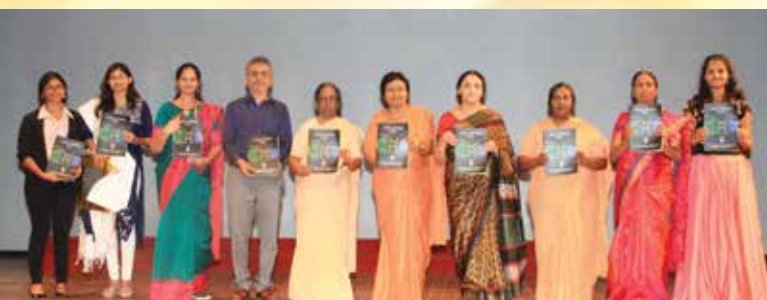
Genetics: 'Gene Express'