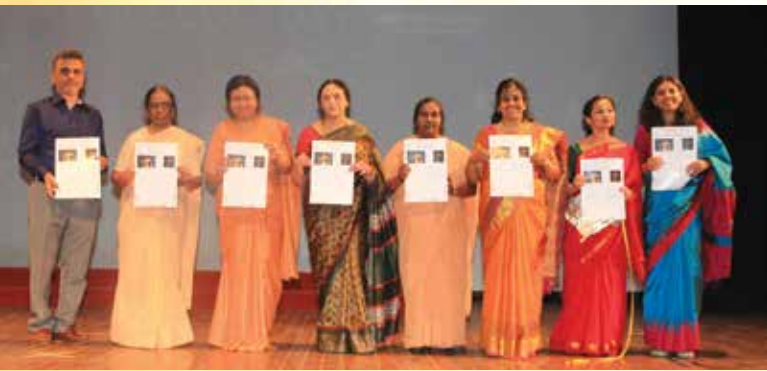
English: 'The Rhetorique'