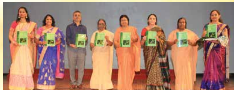
Chemistry and Biochemistry: 'Chem Spectra'