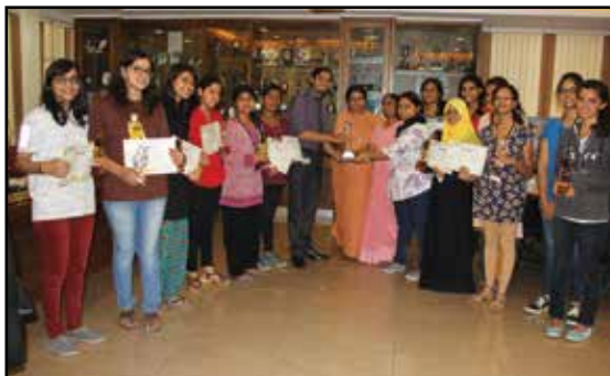
Science Fest, Jain University