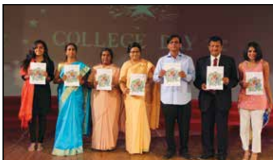
Genetics: 'Gene Express'