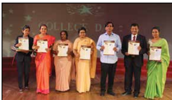
Computer Science: 'Techno Buzz'

A number of our staff have presented papers at national and international conferences and seminars.