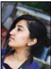
Anaidha for photography at Kairalee Niketan

Students of the department won many national and intercollegiate prizes: