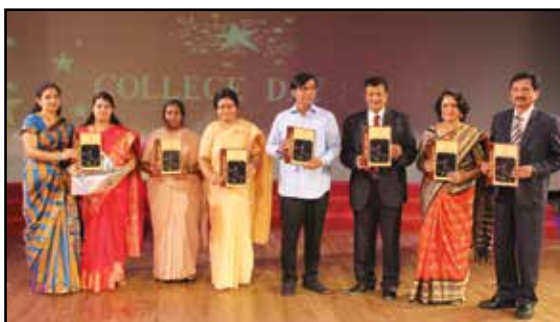
Chemistry and Biochemistry: 'Chem Spectra'