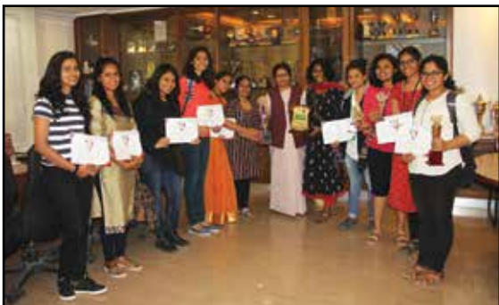
National Psychology Fest, Rajagiri College of Social Sciences, Kerala