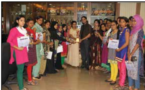
Chemistry Fest, Christ University