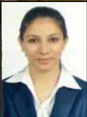
III CEOEPs for Dubsmash at St. Joseph's College