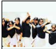
III CEOEPs and III B. Vocs for their films at Christ and Jain Universities