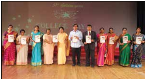
Internal Quality Assurance Cell: 'IQAC Newsletter'

Several departments brought out their Newsletters to record their achievements and endeavours during the year: