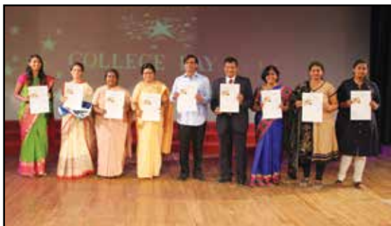
English: 'The Rhetorique'