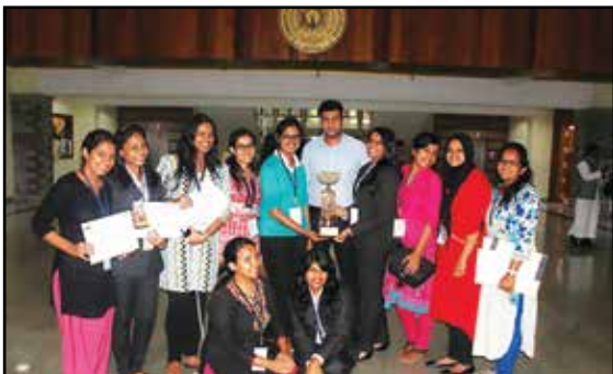
National Tourism Fest, Christ University

➤ Jyoti Nivas College bagged the Overall Championship in: