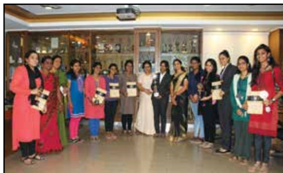
Hindi Literary Fest, St. Joseph's College of Commerce