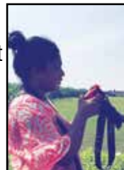
Keya for Photography at St. Joseph's College