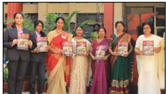
Travel & Tourism: 'Tornare'